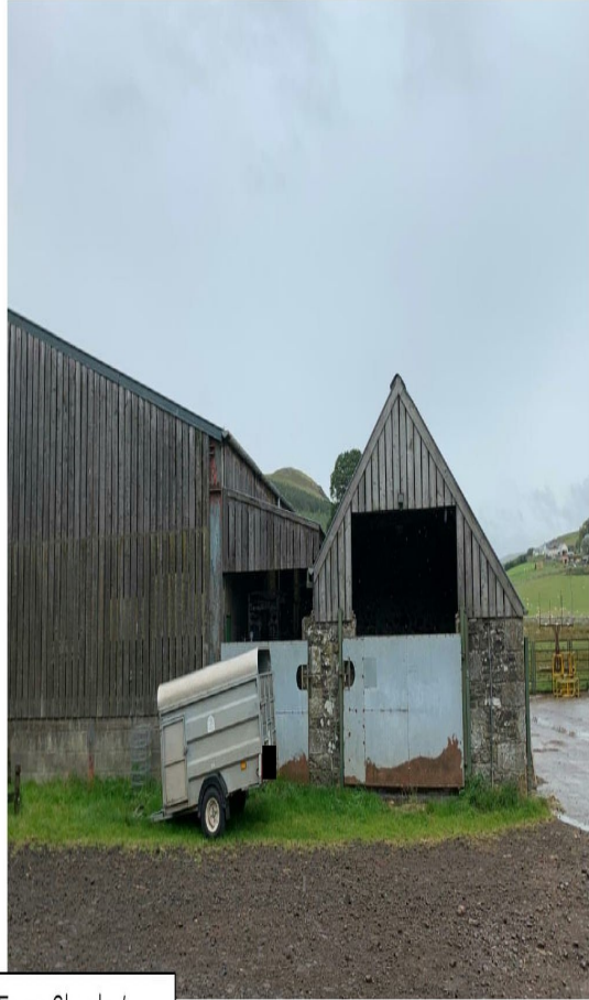
1. Existing Farm Sheds / Buildings (all in active use)