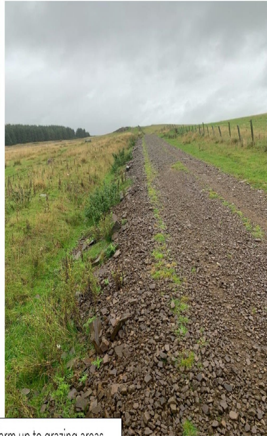
3. Farm track from farm up to grazing areas (Used to feed hill sheep in Winter)