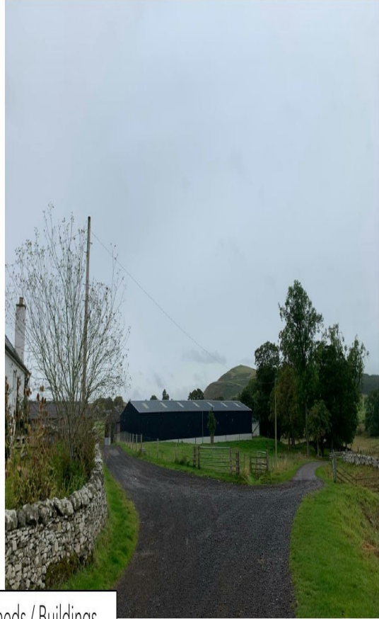
1 and 2. Existing Farm Sheds / Buildings and Existing Farm House (all in active use)