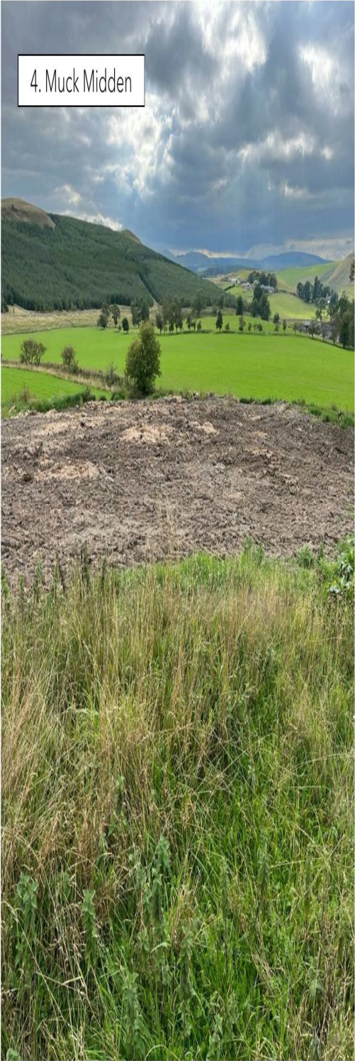
4. Muck Midden